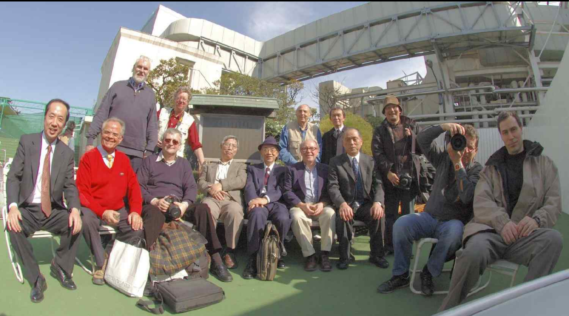
A lot of congratulations. The Nikon Kenkyukai served snacks and I gave free drinks.